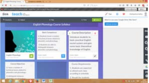
Figure 2 English Phonology Course Syllabus

As the competencies that need to be achieved by the students have been listed, and the course description and course objective written, the topics could then be developed in the English phonology course book, and the activities or tasks and exercises for the students to attain the required competencies can be seen in Table 5.